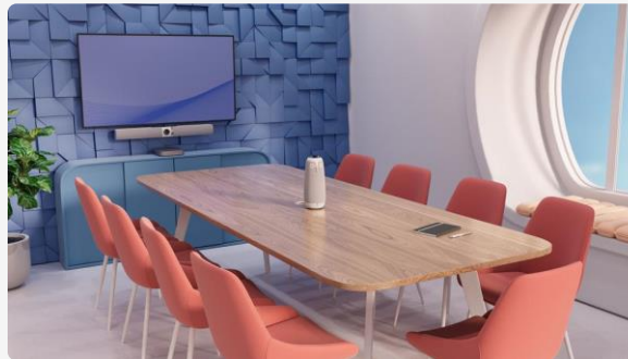
Meeting Owl 3 + Owl Bar

Wirelessly pair with the Owl Bar or a second Meeting Owl for collaboration in larger spaces